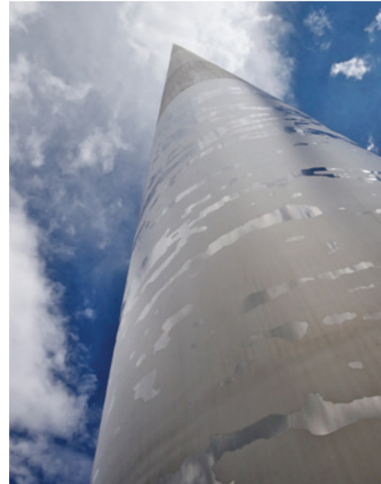
The Dublin Spire – a stunning example of our surface texturing technique showing the versatility of controlled shot peening

Tailoring our services to meet your needs